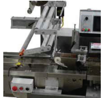
Adjustable Former | Easy size changeover for different products

The H90M's unique EZ-SET end crimper phasing control allows the operator to position the crimper between products during initial setup, then easily fine tune the setting—all while the machine is running. It is powered by a robust 1/2 HP AC drive motor.