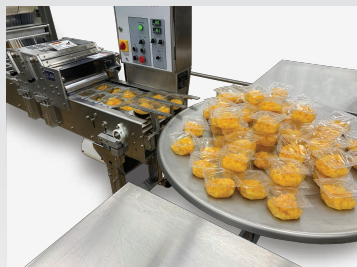
Lazy Susan With Side Tables