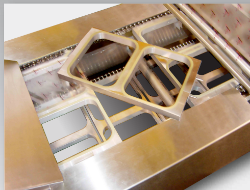
Quick-change tray holders | For processing various container sizes

Casters and a 110-volt electrical supply make the DT30M portable and flexible in operating the machine in a convenient location. The stainless steel and aluminum construction is ideal for strict sanitary applications.