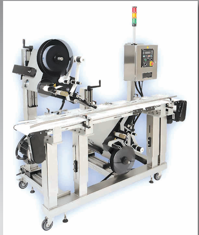
Illustration above shows Two Label Applicator Heads (For Top & Bottom of a Container)

Standard Wipe-On systems come complete with a 6-foot by 6-inch horizontal conveyor, a single applicator head I/O mount, optional table-top chain or Dorner belt conveyer, a microprocessor controller hung from an articulator arm and guide rails. The conveyor height is fully adjustable between 32 and 39 inches and is capable of handling a variety of products. Each conveyor system includes heavy duty construction, robust locking casters, vertical, horizontal and swivel adjustments for applicator head mounting and a heavy duty 3/8-horsepower adjustable speed motor.